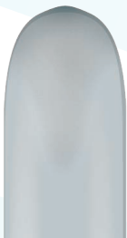
Silver LCP #54694 (50 ct.)