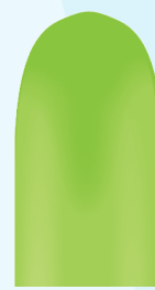
Lime Green LCO #54693 (50 ct.)