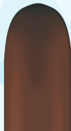
Chocolate Brown LCO #54661 (50 ct.)