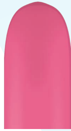
Rose LCO #54685 (50 ct.)