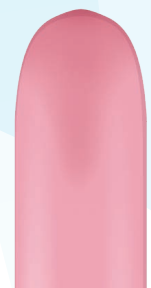
Pink LCN #54649 (50 ct.)