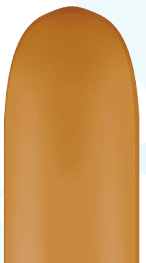
Mocha Brown LCO #54660 (50 ct.)