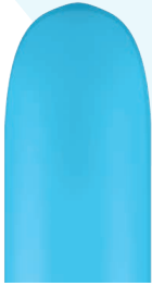
Robin's Egg Blue LCO #54664 (50 ct.)