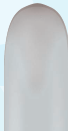
Gray LCO #54688 (50 ct.)