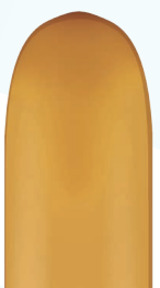
Gold LCP #54696 (50 ct.)