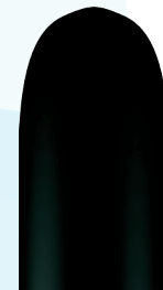
Onyx Black LCO #54690 (50 ct.)