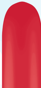
Red LCN #54616 (50 ct.)