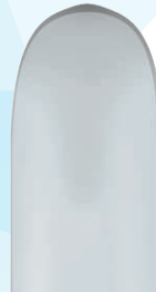
Diamond Clear LCO #54691 (50 ct.)