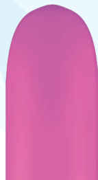
Neon Magenta LCP #54709 (50 ct.)