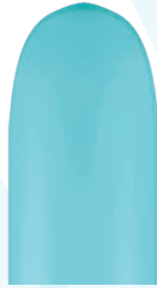
Caribbean Blue LCO #54670 (50 ct.)