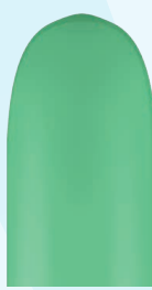
Wintergreen LCO #54680 (50 ct.)