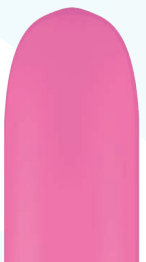
Neon Pink LCP #54703 (50 ct.)