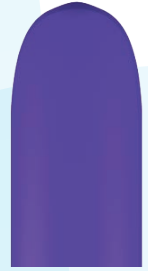
Purple Violet LCO #54666 (50 ct.)