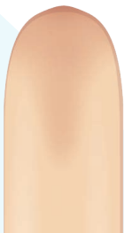
Blush LCO #54659 (50 ct.)