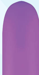
Neon Violet LCP #54708 (50 ct.)