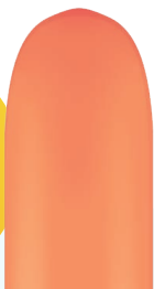
Neon Orange LCP #54705 (50 ct.)