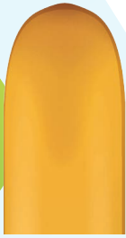
Goldenrod LCO #54683 (50 ct.)