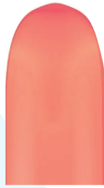
Coral LCO #54677 (50 ct.)