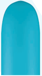
Tropical Teal LCO #54681 (50 ct.)